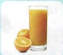
1 fruit juice

2 Listen, point and say The Tiger Street word rap .