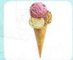
10 ice cream